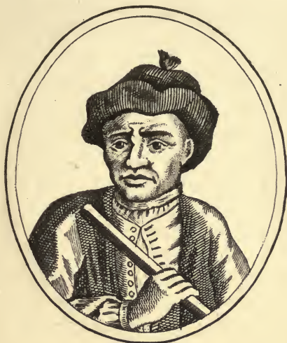
JONATHAN WILD, Thief Taker General of Great Britain and Ireland 1725.